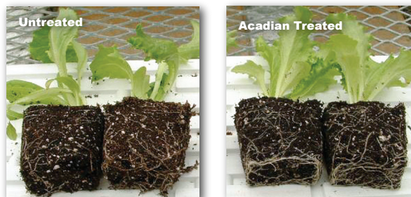
2008 Greenhouse Lettuce Trial, Dr. James S. Craigie Research and Development Center, Canada

improved root development and doubled the number of small roots over the control.